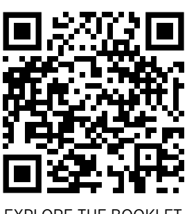
EXPLORE THE BOOKLET CONTENT ONLINE

Life is full of opportunities. Opportunities are like doors, waiting to be opened. Doors to fulfill a dream, doors to something new, to something better. Doors to success, a new beginning, or a fresh start. Open one door, and it will open a thousand others.