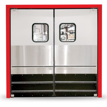
Hospitality and Culinary Arts